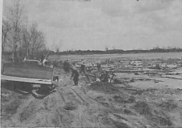
WORK STARTS ON CLEANING OUT THE MILL POND--Workmen begin dragging out the old stumps on the north shore of the Weidman pond. Above, Willard Searles, new owner of the new-lake project, stands beside freshly-hauled-out debris.