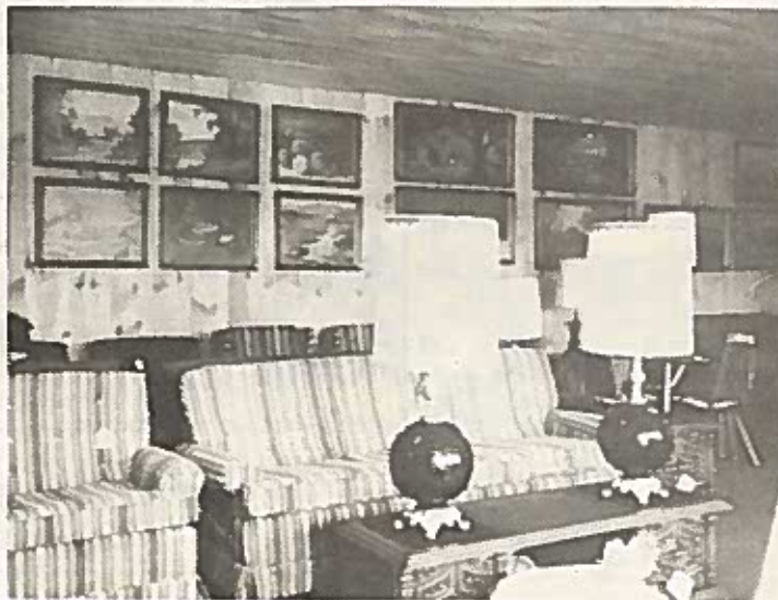
A VERY SMALL SECTION OF THE HUGE DISCOUNT STORE