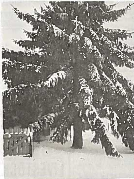
MARCH 1, 1971--WE HAD THIS KIND OF SNOWFALL after a mild beginning of the month. It was a quiet precipitation, however, and mainly gave us Christmas scenes such as this above.

Radio reports said he was discovered by co-workers at the mill who realized he had not been seen for some time, and they went looking for him and found him in the corn bin.