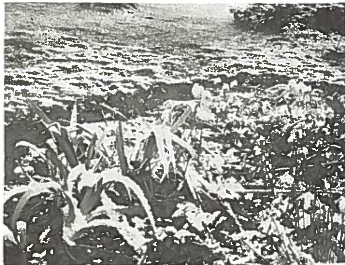
FIRST SNOW OCTOBER 19--Caught flower beds by surprise, with blooming chrysanthemums and green iris leaves bedecked with the white stuff. We've had a good taste of winter since, with snow melting but average temperatures ranging from the 'teens to the high 40s.